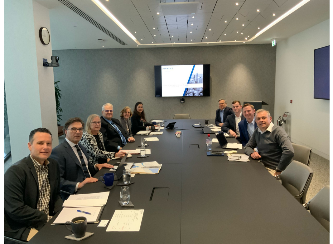
April Meeting in London including Diocesan Leaders, Brokers & London syndicates!

Brokers talking to the Markets --□ Note Diocesan Leaders Joining us